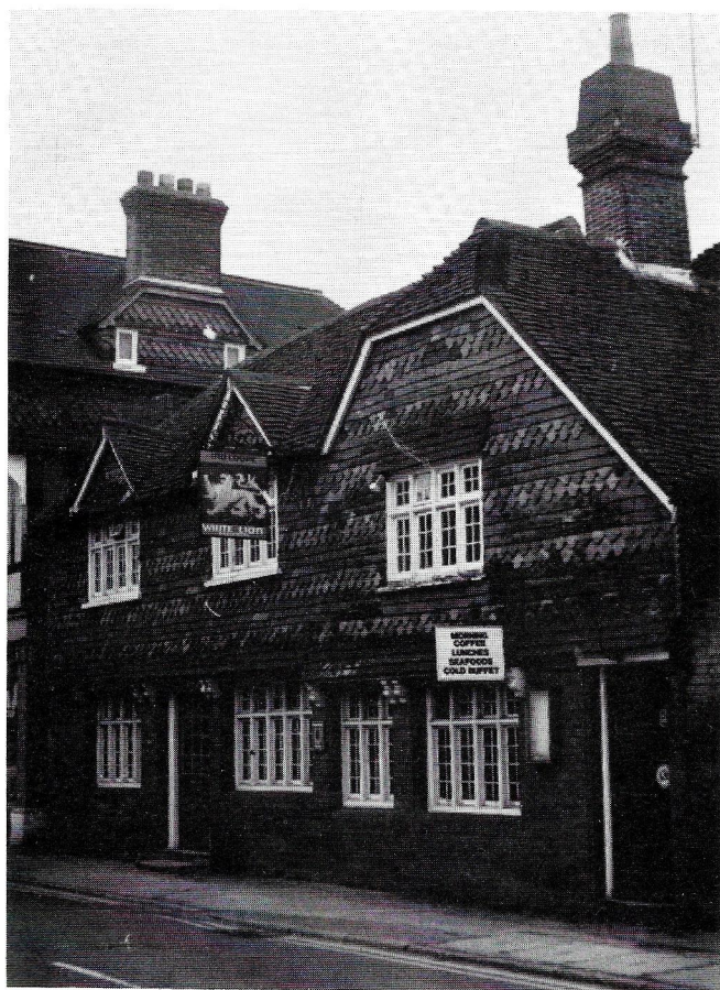
ABOVE: The White Lion, Haslemere, which was recently closed despite protests to the owners, Ind Coope. The 16th century building is to be sold delicensed.

The Passfield Oak, near Whitehill, is now a free house, having been sold by Friary Meux, with licence - a happier situation than the White Lion in Haslemere, a Good Beer Guide pub closed by Friary in March, and now for sale delicensed. The Passfield Oak, at the time of writing, is being "renovated", and is serving Ballard's Wassail (at 80p a pint) and Marston's Pedigree.