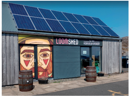
The Loomshed brewery in Tarbert

We had to catch a ferry from Leverburgh to Berneray, and beside the ferry car park was the Isle of Harris Brewery, they had 10 beers available, again all keg but a far better choice.