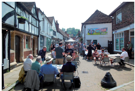
The road outside the Star was closed during the presentation