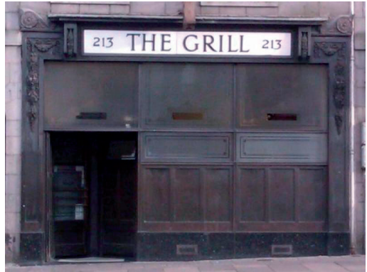
The Grill pub in Aberdeen

where smaller traditional bars were found they were often covered in fairy lights. Somehow the words tradition and fairy lights do not fit comfortably together. Broughty Ferry is on the same line and boasts four GBG pubs. The only one I can recall from the last visit was the Fisherman's Tavern which was one of few pubs boasting 25 consecutive years in the GBG but was subsequently dropped for one year spoiling its perfect record. It remains a fine pub as is the Ship Inn next door. Returning to Dundee by train the platform was heaving. Obviously, the attraction of four GBG pubs in one town was not to be missed by CAMRA members. On the Sunday we returned to the Bank where we had started three days earlier. The pub had been drunk dry and there was no real ale despite ordering three times the normal amount of beer. Next year the 2025 National CAMRA AGM is in on my home territory at Torquay!